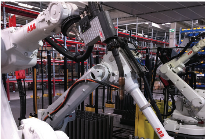
Industry Robots in the ROLs fully automated manufacturing plant.