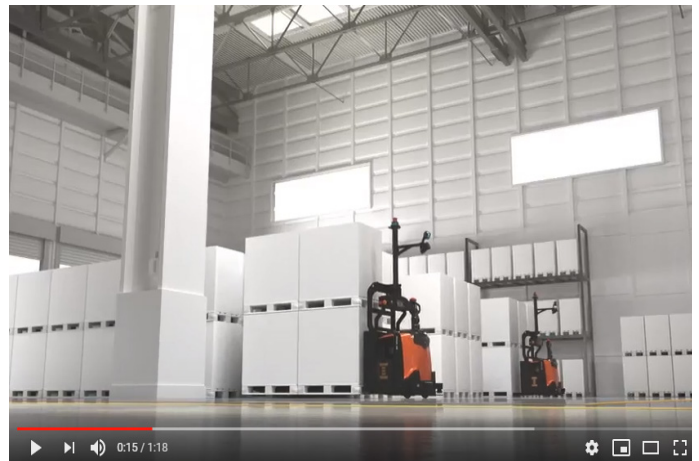
AGV-fork lifts in action, Automated pallet transport with Toyota.

“ For us, a strong, flexible and agile partner with experience in connecting and integrating IFS Applications with other systems was the most important consideration ”